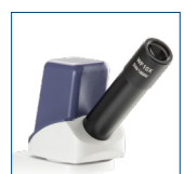
Digital mono head