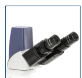
Digital bino head