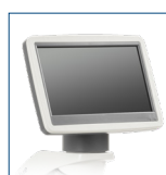
Digital LCD head