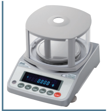
FZ-300iWP with small Breeze Break (standard on 1mg models)

For the user that wants it all, the FZ-iWP adds internal calibration to complement the IP-65 rated dustproof and waterproof features. Here is a balance that be used virtually anywhere.