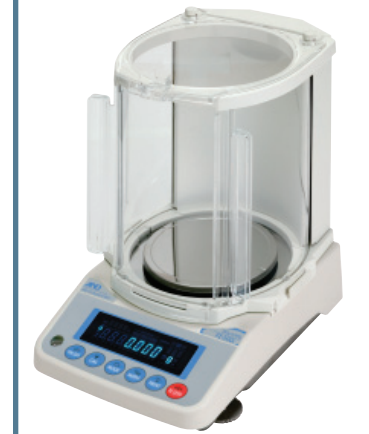
FZ-300i with optional Breeze Break FXi-11